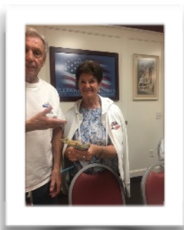
Meeting adjourned at 7:38 P.M.